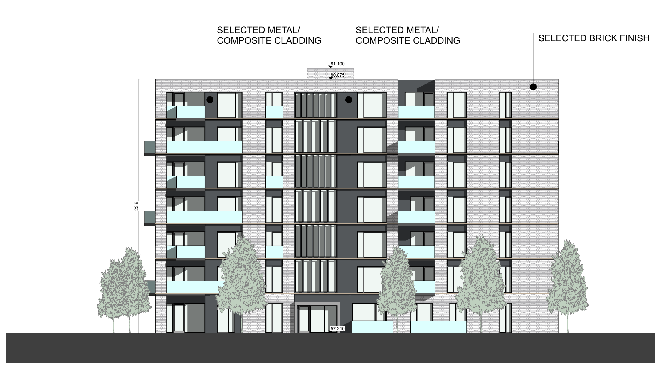
Elevation G-G SCALE: 1:200