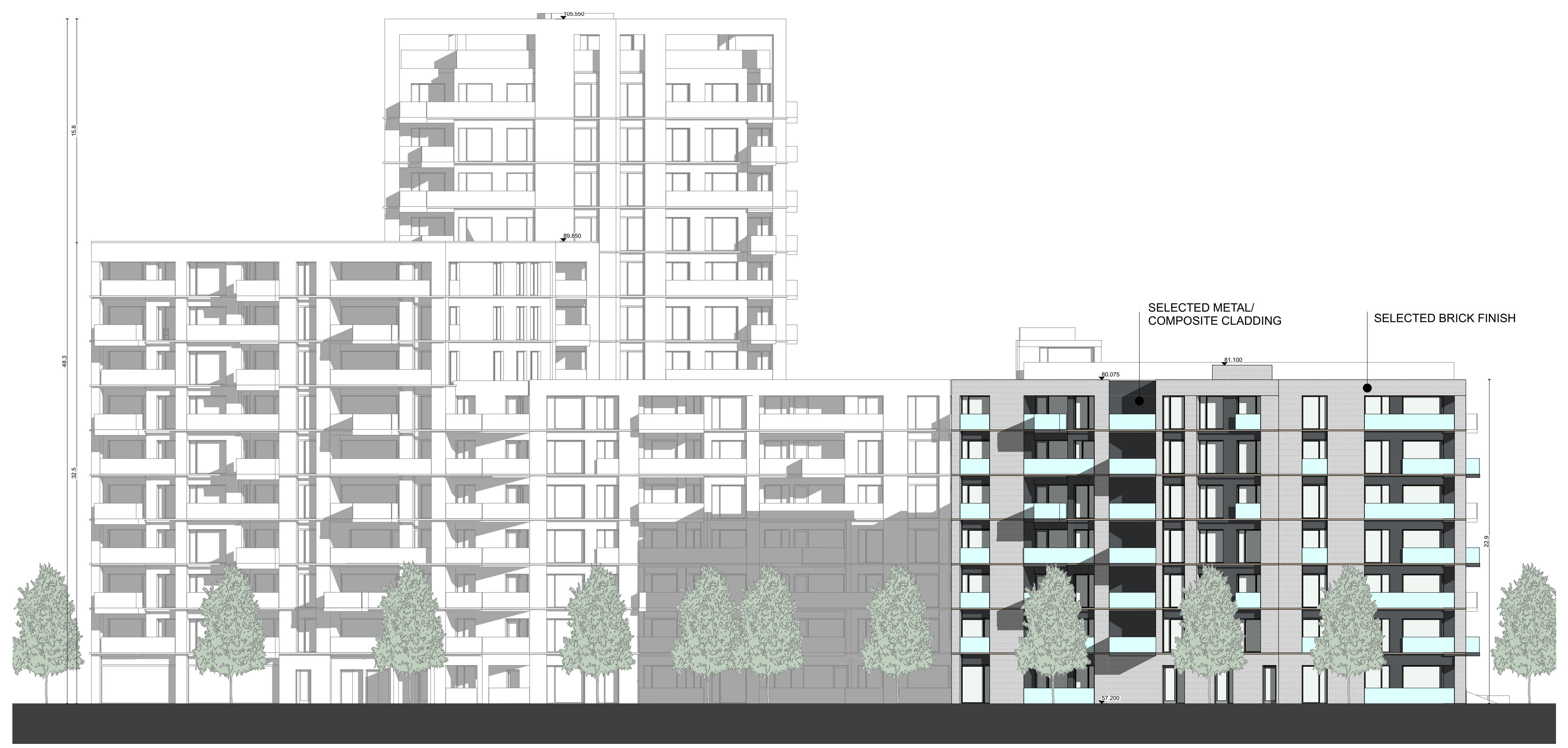
Elevation H-H SCALE: 1:200